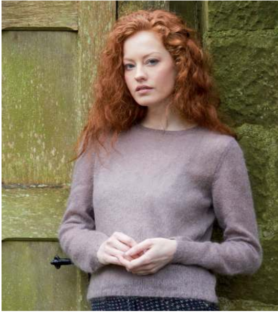
Sample size 81-86 cm (32-34")

13 [14: 15: 16: 17.5: 18.5: 19: 19.5: 20.5] cm (5 [5½: 6: 6¼: 7: 7¼: 7½: 7¾: 8] in)