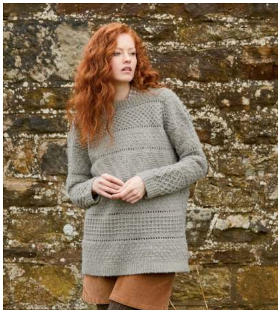
Sample size 81-86 cm (32-34")