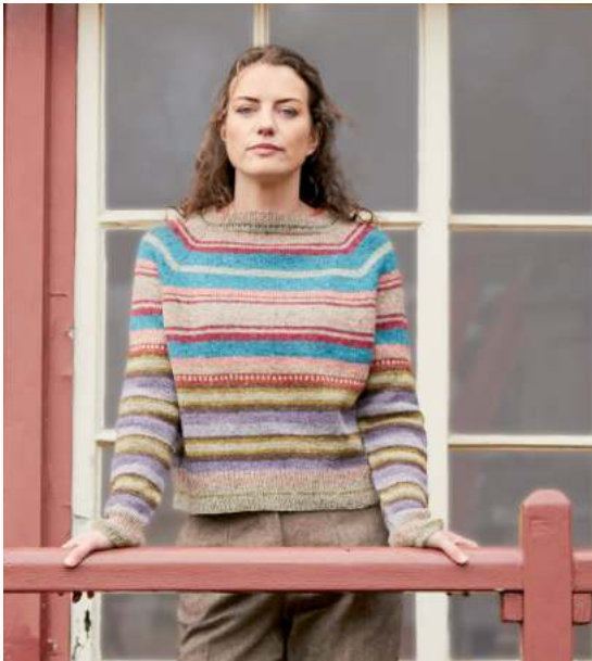
Sample size 81-86 cm (32-34")