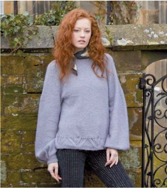
Sample size 81-86 cm (32-34")