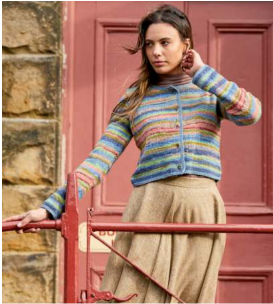
Sample size 81-86 cm (32-34")