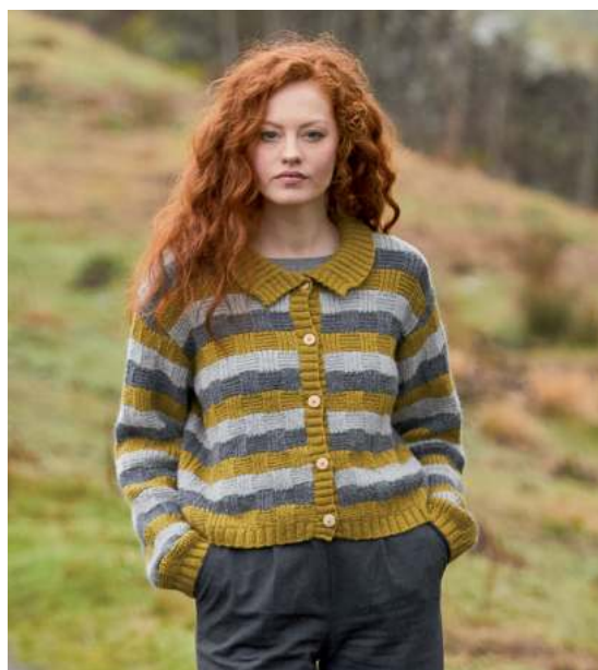
Sample size 81-86 cm (32-34")